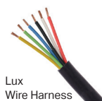
Lux Wire Harness