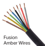
Fusion Amber Wires